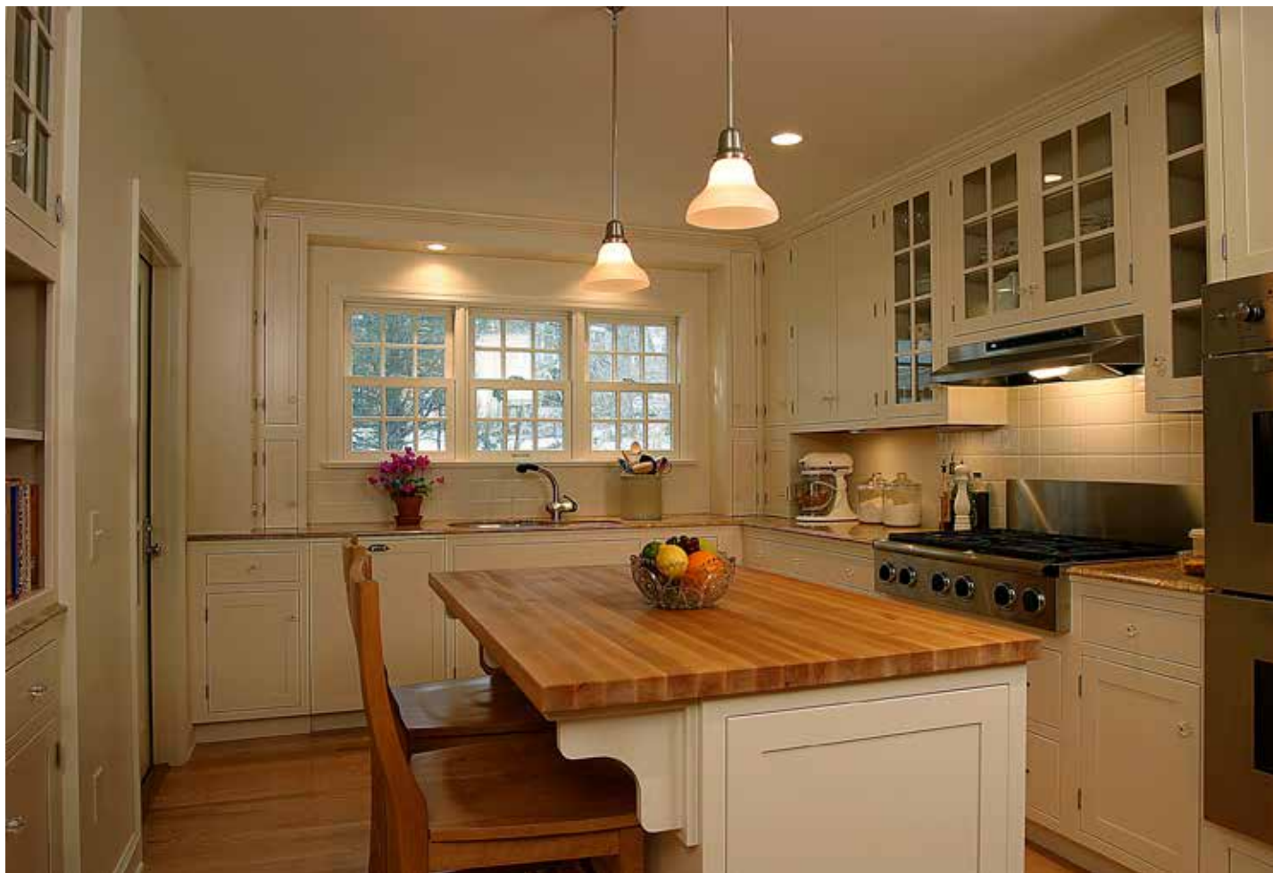
This classic kitchen in our Nakoma neighborhood features inset custom cabinetry providing maximized storage. The butcher block island complements the granite countertops and glass upper cabinets open up the look and feel of this space.

Whatever type of kitchen you choose, it needs to be a relaxing space where you can be inspired to create the masterpieces your family enjoys.